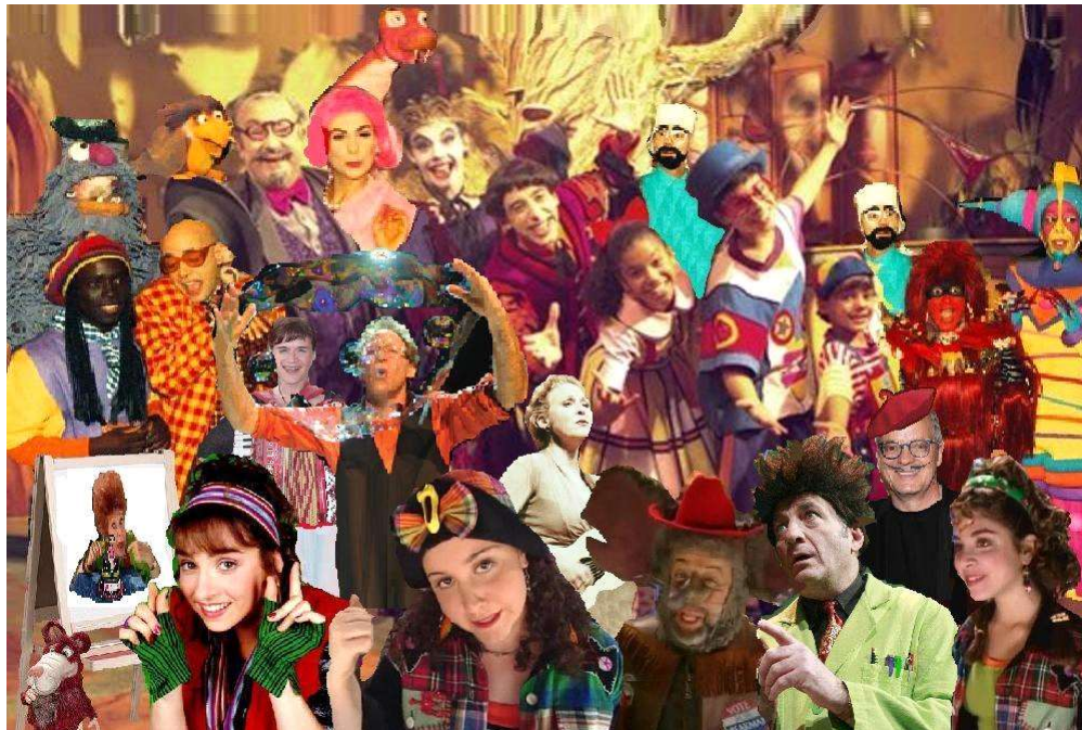
Originally posted in "Castelo Rá-Tim-Bum, Entusiastas" on February 21, 2016.